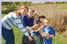
The YMCA... helping to build strong kids, strong families and a strong community!

Join us for an exciting family event on New Year's Eve, December 31st from 7:30pm - Midnight