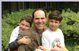
Father's, are a crucial part of a child's life. Read about the Y's Fatherhood Initiative!