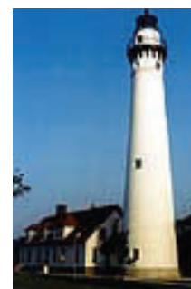
Lighthouse Run June 19th

The YMCA's progressive gymnastics program helps kids to start young and build their skills to tumble, flip and handle body movement more confidently.